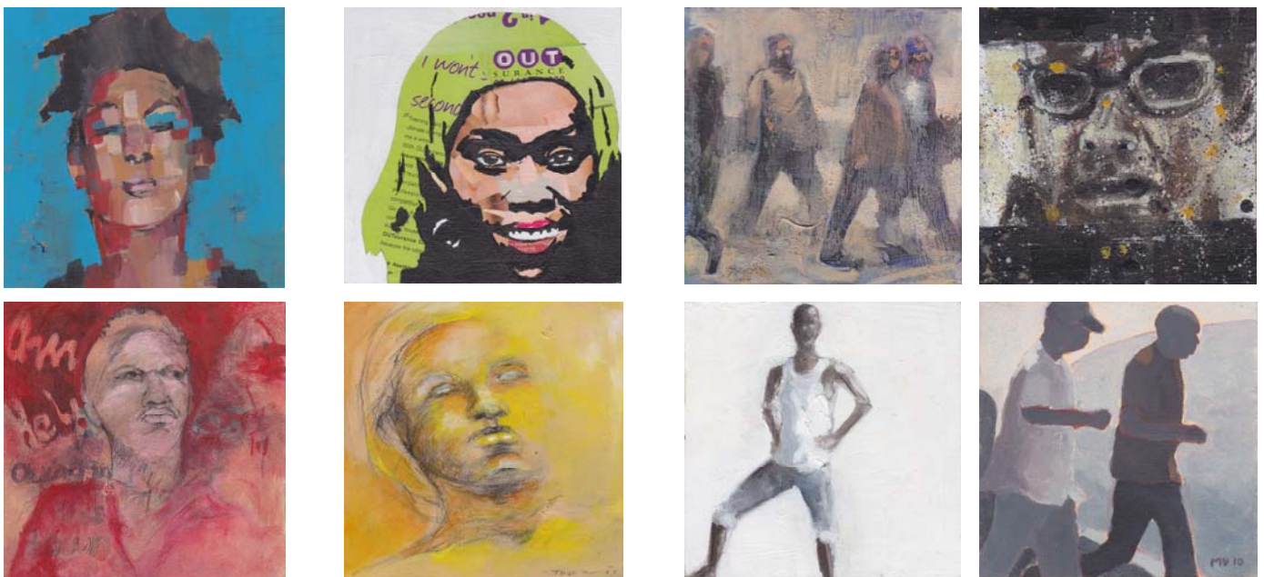
Detail from Creative Block , Various Artists.

Africa Foundation (USA) will host a Gala Dinner to launch the auction catalogue on 12 th October that will also feature highlights of the Art for Africa™ New York collection. The entire collection will be exhibited at Sotheby's New York from 12 th -17 th November.